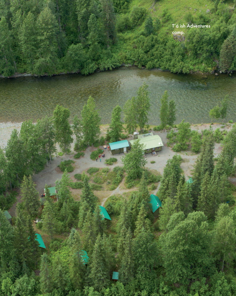
T'á ish Adventures camp.