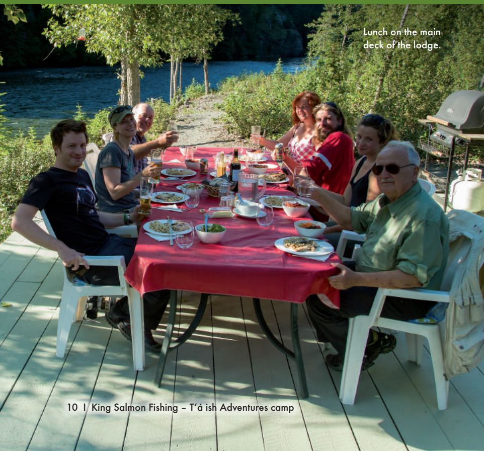
Lunch on the main deck of the lodge.