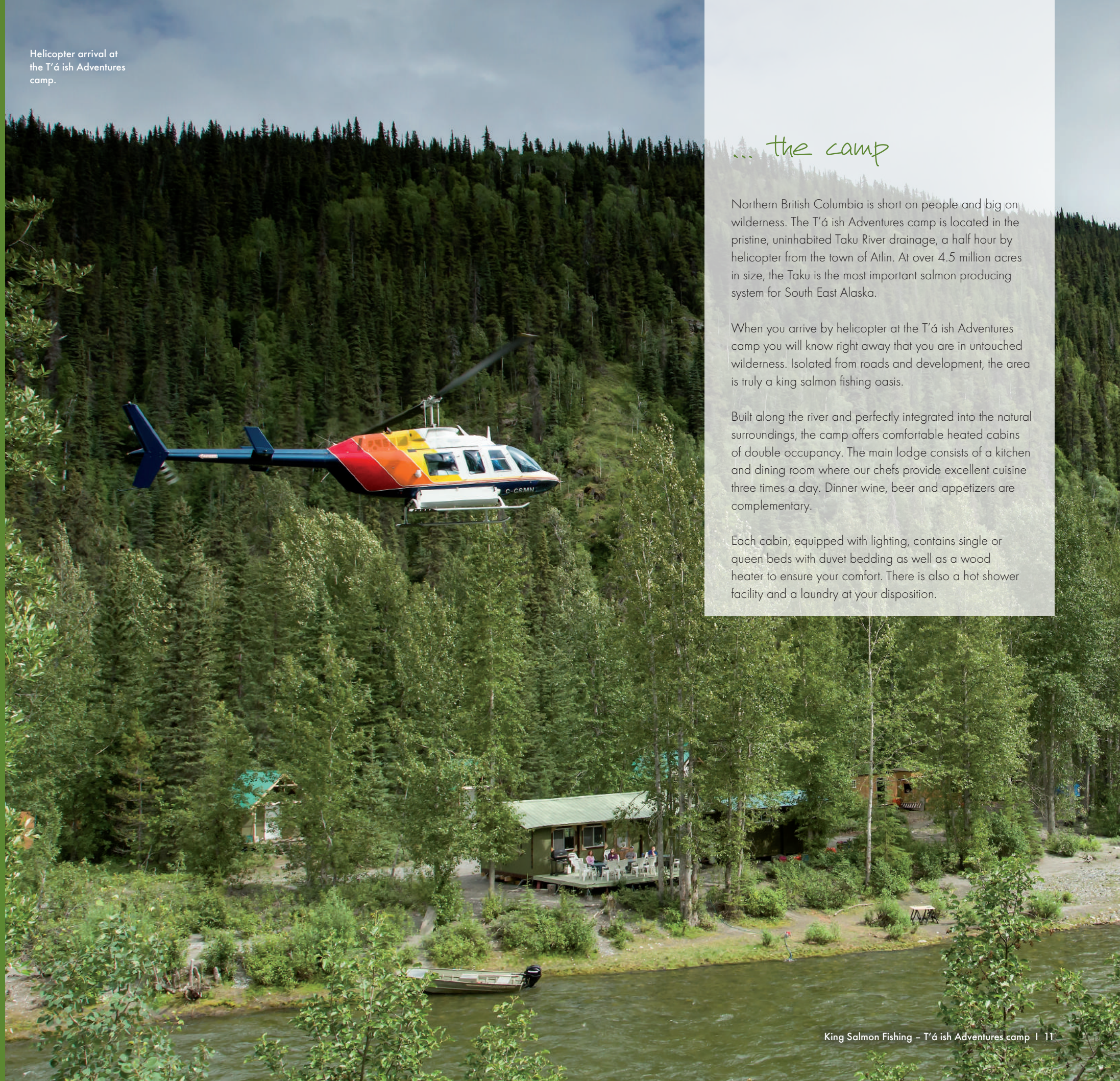
Helicopter arrival at the T'á ish Adventures camp.